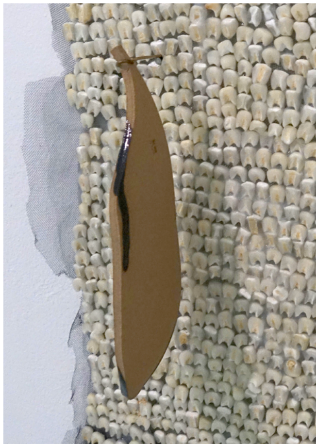
LAURA PORTER (WITH SABRINA VIOLET), CORNSWEET, 2024 (detail) Corn, tulle, ceramic.