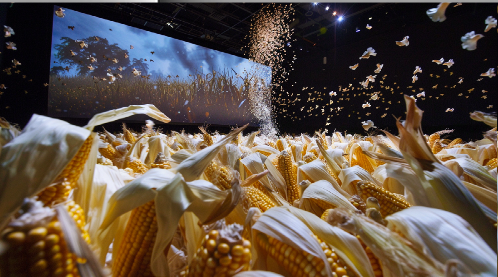
The storyboard follows a chaotic yet deliberate rhythm, governed by an internal logic.