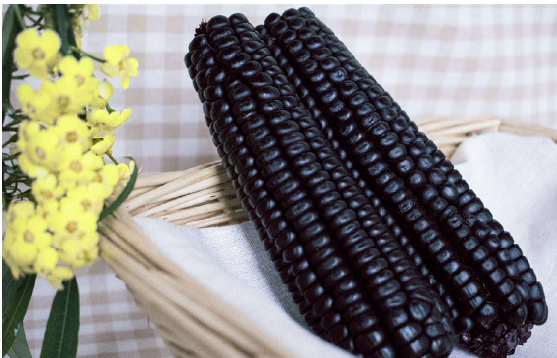
LAURA PORTER, GENERAL SPOILS 2019 Photo print on plexiglas